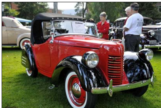
When I grow up I want to be a Full Classic