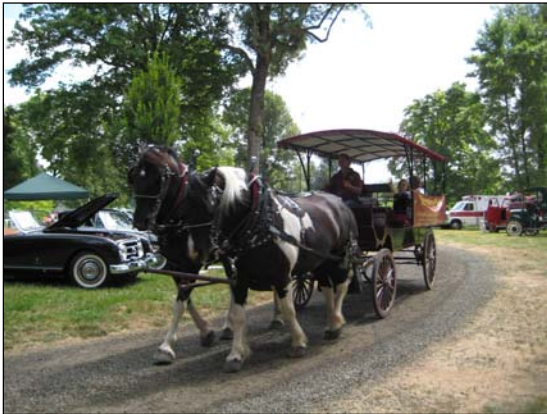
Two Horsepower Taxi

Mix-matched and outlandish costumes for a motley crew, compelling drum beats, the shouting and syncopating brass band instruments, clowning acrobats on stilts, beautiful prancing girls in skimpy yet tasteful but extreme outfits, all appearing to be having great fun...well...that is the March Fourth Marching Band, making its fourth annual appearance at "Carlton - A Walk In The Park" celebration in the tiny Yamhill town of the same name, on August 1.